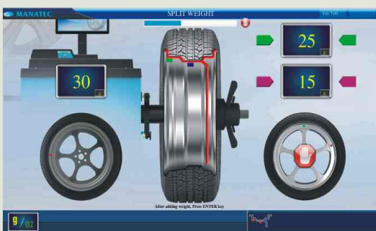
Split weight program (spokes program) helps to split the weight to be hidden behind the spokes of the alloy wheels.