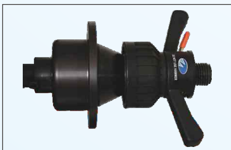
Mid centering device for positioning of wheels accurately at center of the rotor assembly. Quick Change Lock Nut (QCLN) to ensure fast mounting and removal of wheel.