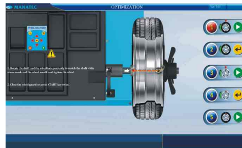
Optimization program helps in reduced wheel weights consumption.