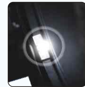
Torch light indication