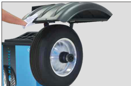
Automatically starts when wheel guard is closed