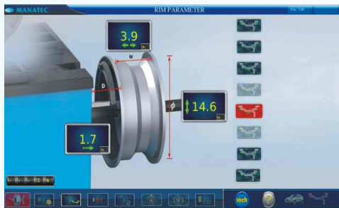
7 Alloy wheel (ALU) functions.